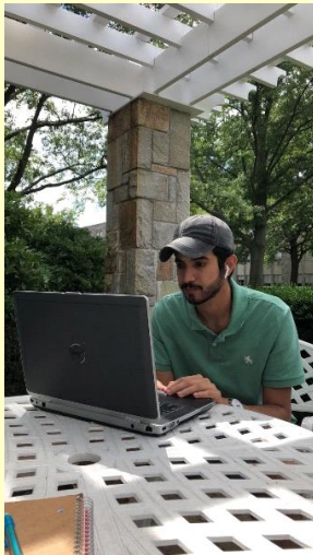
A TLC student watching an English movie to improve his language.

All of this will help you to learn English faster.