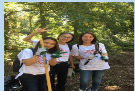
Some TLC students who participated in Service Day last year.

To sign-up you can visit the TLC office and speak with Camille or send her an email at holcombc@stjohns.edu