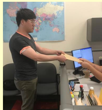
A TLC student registering for classes by paper.

Come to the institute's location in Queens or Manhattan and go to the office and request a registration form and fill it out.