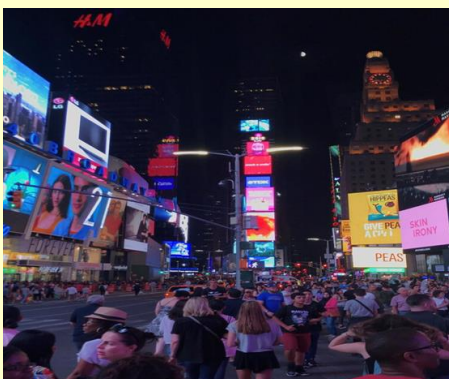
A numerous number of tourists visiting Times Square at night to see the bright lights, skyscrapers, Broadway shows, and shopping.

However, the first thing that comes to your mind when you think about Manhattan is Times Square. It is the first destination for the visitors of New York. According to U.S News, Times Square is the metaphor for New York City and the biggest number of people go to Times Square at the annual New Year's Eve celebration. There are a lot of activities to do in Times Square. There are many luxurious restaurants and coffee shops you do not want to miss it. Also, you can watch people that do different performances like singing and dancing. However, the best time to visit Times Square is at night where you can watch the big commercial screen on all the buildings there.