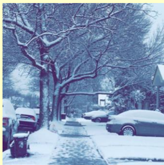
The winter in NYC is very hard.

I hope you come to NYC. It will help you to see and learn a lot of new things.