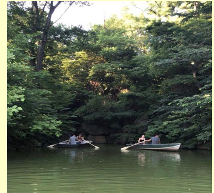
A view of Central Park