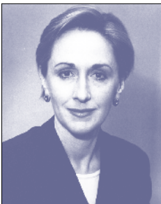
Hon. Carla E. Craig Chief Judge U.S. Bankruptcy Court E.D.N.Y.