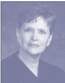
Hon. Colleen McMahon Chief Judge U.S. District Court S.D.N.Y.