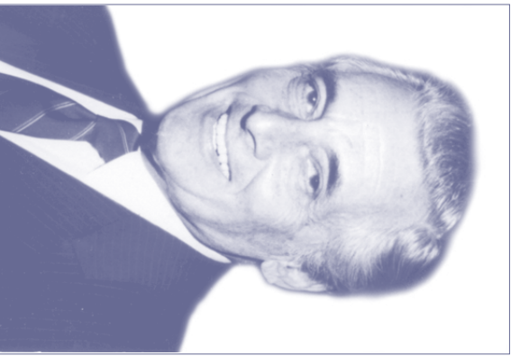
Chief Bankruptcy Judge Conrad B. Duberstein '41

66 Canal Center Plaza Suite 600 Alexandria, VA 22314 www.abi.org