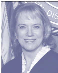
Hon. Cecelia G. Morris Chief Judge U.S. Bankruptcy Court S.D.N.Y.