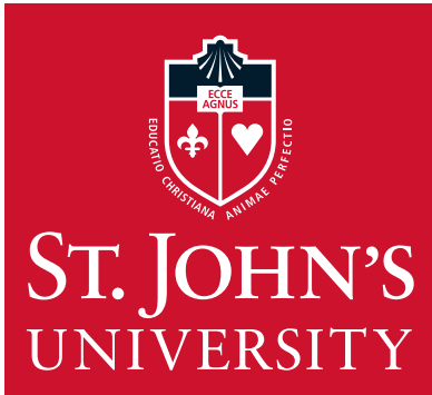
VERTICAL TWO COLOR WITH WHITE OUTLINE