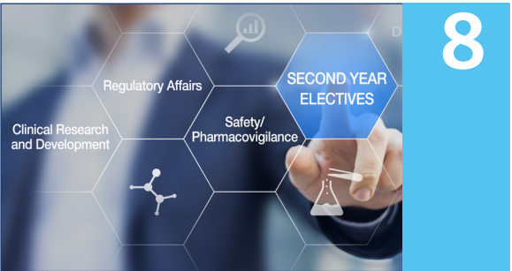
FELLOWSHIP ELECTIVE ROTATIONS