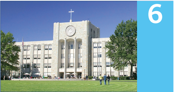
ST. JOHN'S UNIVERSITY