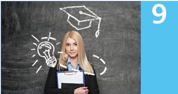
FELLOWSHIP RESEARCH AND ALUMNI