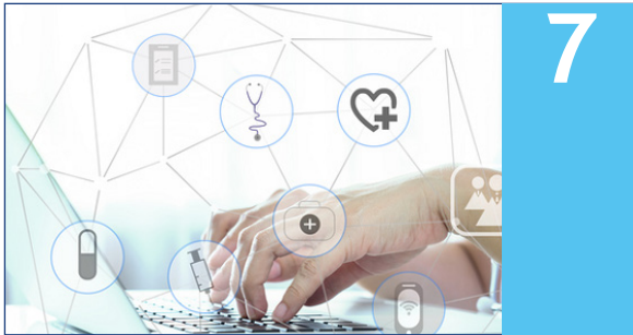
MEDICAL AFFAIRS FELLOWSHIP