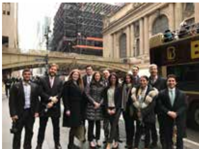
One Vanderbilt (Spring 2018)