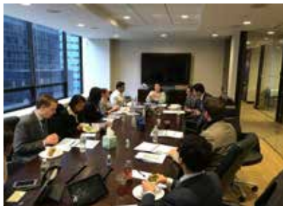
Ladder Capital Corp (Fall 2018)