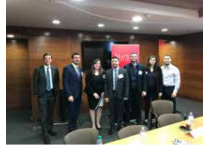
Fourth Semiannual Recent Alumni Perspectives Event (Spring 2019)