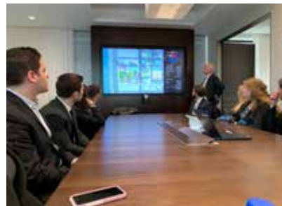
Hudson Yards (Spring 2019)