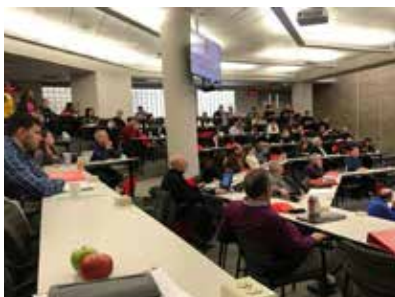
"All About Real Estate Closings" Continuing Legal Education Event (Spring 2019)