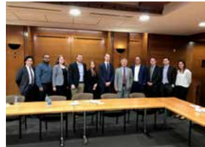
Landlord-Tenant Practice In Housing Court - A Discussion With The Hon. John S. Lansden '91 (Spring 2019)