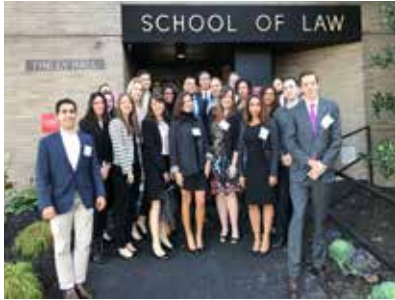
First Semiannual Alumni Perspectives Breakfast (Fall 2017)