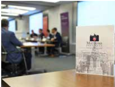
Transformation of East Midtown Conference (Fall 2018)