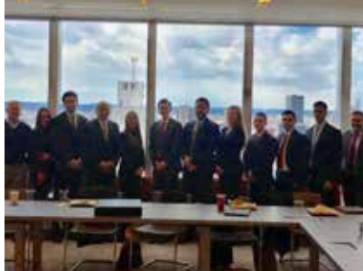
Advisory Board Lunch (Spring 2018)