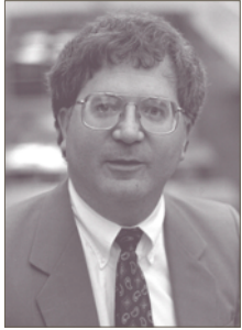
Hon. Michael W. McConnell U.S. Court of Appeals Tenth Circuit

Some of the nation's leading bankruptcy and appellate judges will serve as judges for the final round of the 2005 competition.