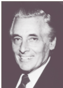
Hon. Conrad B. Duberstein Chief Judge U.S. Bankruptcy Court E.D.N.Y.