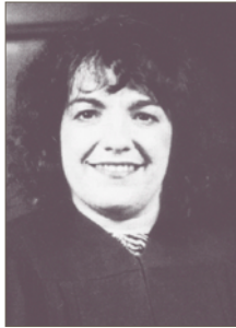
Hon. Rosemary Gambardella Chief Judge U.S. Bankruptcy Court District of New Jersey