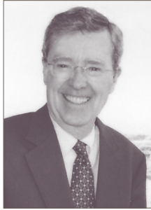
Hon. Diarmuid O'Scannlain U.S. Court of Appeals Ninth Circuit