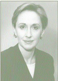
Hon. Carla E. Craig Chief Judge U.S. Bankruptcy Court E.D.N.Y.