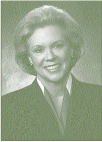
Hon. Marjorie O. Rendell U.S. Court of Appeals Third Circuit

Some of the nation's leading bankruptcy and appellate judges will serve as judges for the final round of the 2008 competition. The quarter- and semifinals will be judged by bankruptcy judges from across the nation.